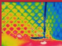
Recording inside the raising roof. Inside 20°C, outside -20°C